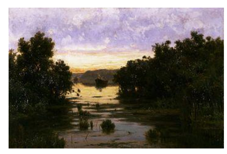
PALUDI DI FRANCESCO LO